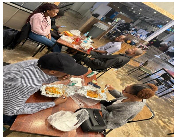
Interactive Session and Refreshment